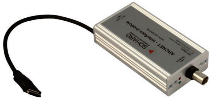
Module type "PCMCIA", SH KOAX-PCMCIA

Use in connection with SH ARC-PC104, SH ARC-ISA-HUB, SH ARC-M3-HUB, SH ARC-PCMCIA, SH ARC-PCIe-M, SH ARC-PCIu-M, SH ARC-PCI104 and SH ARCALYZER