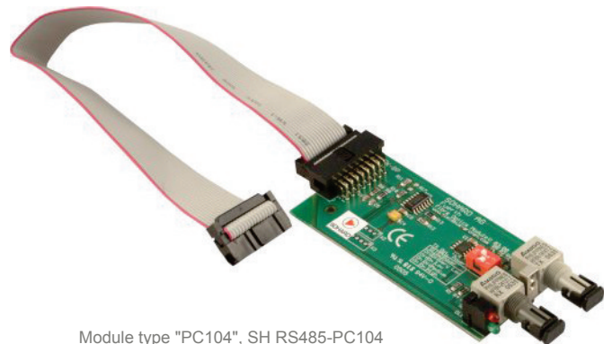
Module type "PC104", SH RS485-PC104